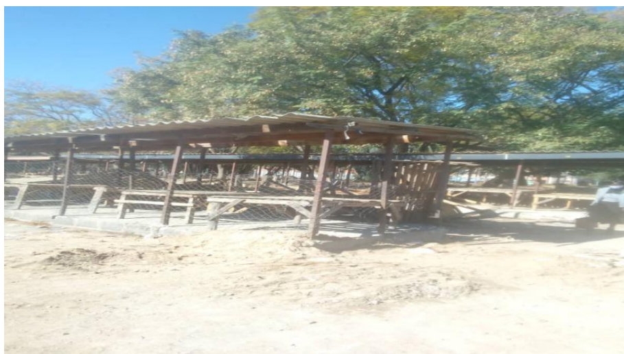
Figure 2 Empty shells after the closure of all informal activities in the city of Masvingo

The popular informal market in the city, the Chitima Market, which is the biggest market for informal activities in Masvingo city is a no-go area for the all informal traders despite housing different informal activities, which include those selling food, clothing, and farm produce. This market was forcibly closed by heavily armed riot police as a compliant measure to prevent spread of COVID-19. The market has been closed for more than six months now. Even when the country then moved from level five to currently level two of lock-down which allowed more businesses in the formal to be opened, those in the informal sector remained closed. Figure 2 below shows some of the empty informal shells as a result of closedown. All these places were providing livelihoods to thousands of people in the city but they have remained closed.