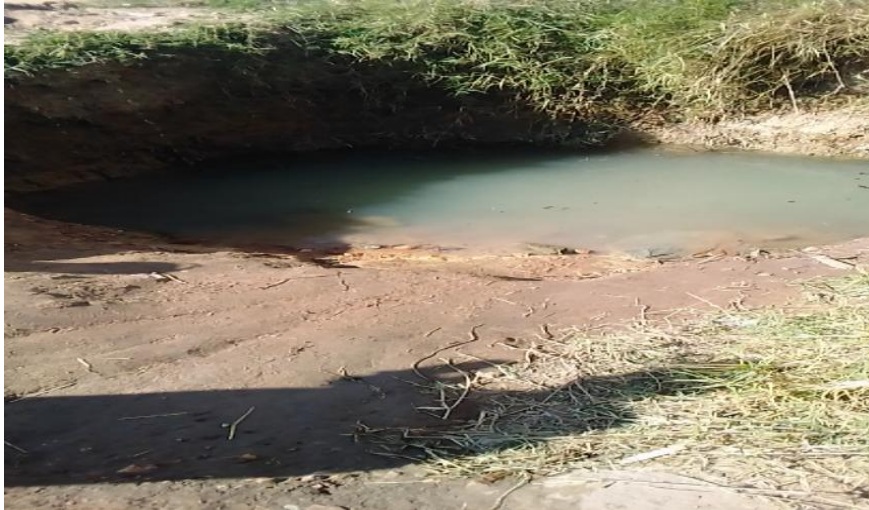
Figure 3 One of the shallow open wells used as water point by people in the informal sector

informal sector, water supplies were discontinued long back and these people are relying on community boreholes and unprotected wells. The tendency to prefer the formal sector at the expense of informal is a disenfranchisement of people in the informal sector's right to receive city services and it exposes them to contraction of COVID-19 disease. This is not sustainable, unjust and shows the exclusionary urban policies. Water is very important in the fight against COVID-19 pandemic as people are required to regularly wash their hands and exercise good hygiene. Figure 3 below shows one of the open well used as water points used by some people in the informal sector.